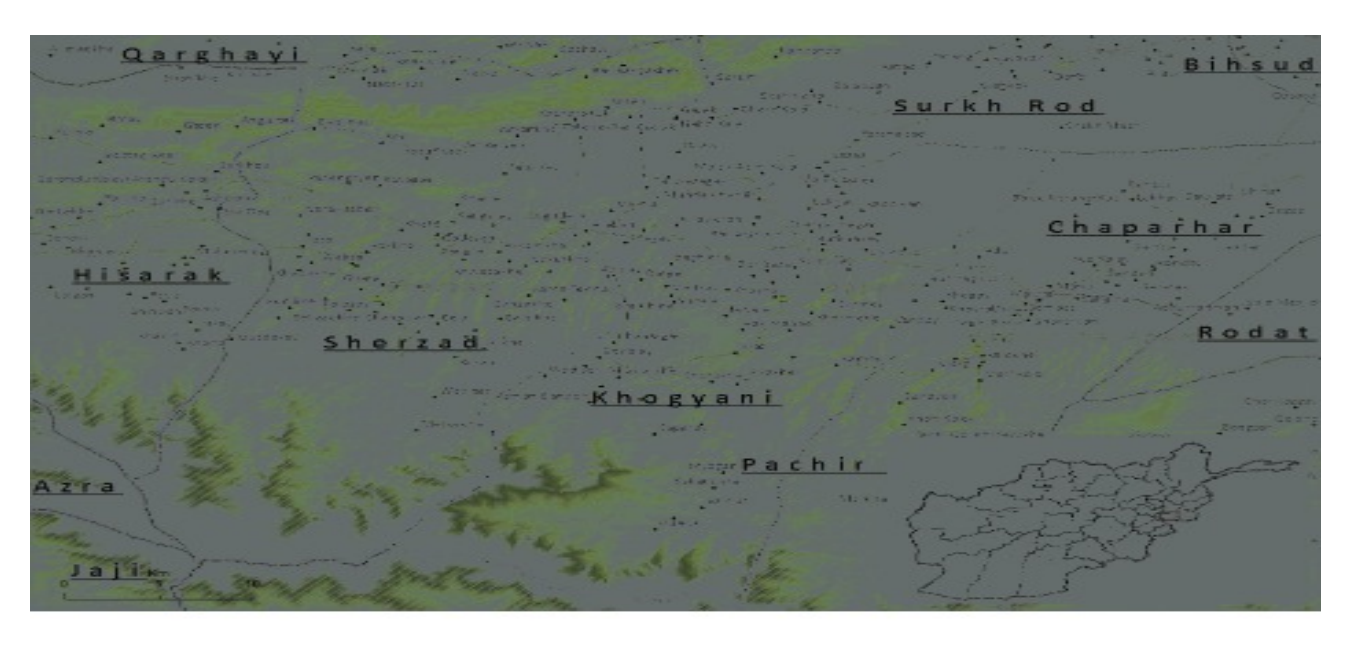
Figure-1: Map of Khogyani

The personal security in Khogyani has worsened. A high percentage of people continued to fear attacks from a range of sources, including personal enmities. While more people had heard of Afghan Local Police (ALP) in the district, it was not trusted, and its effectiveness rated low.